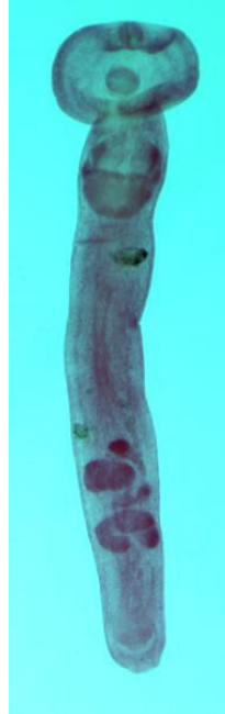
Foto. 1. Codonocephalus urniger , larvae - general aspect. Original.

Etiology. The trematode Codonocephalus urniger Rudolph, 1819 (Figure 1, Photo. 1) parasites under the skin, into the body cavity, muscles and other organs of the amphibians.